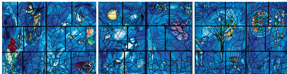
Cover and above images: Stained glass windows, Marc Chagall, Art Institute of Chicago

Co-sponsored by the Faculty of Arts and Social Sciences at Dalhousie University.