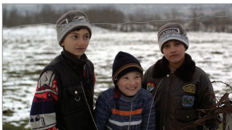
A People Uncounted