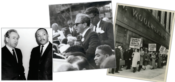
Joachim Prinz: I Shall Not Be Silent