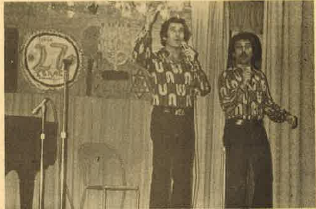
The Re'im Duo from Israel perform.