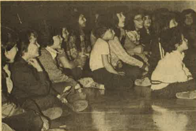
Delighted devotees of the Re'im Duo at a special "Children's Concert" on Sunday morning.

Israeli folk dancing and refreshments followed this outstanding show of support and solidarity for the State of Israel.