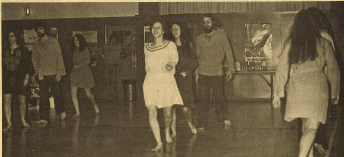
The Jewish student dance group