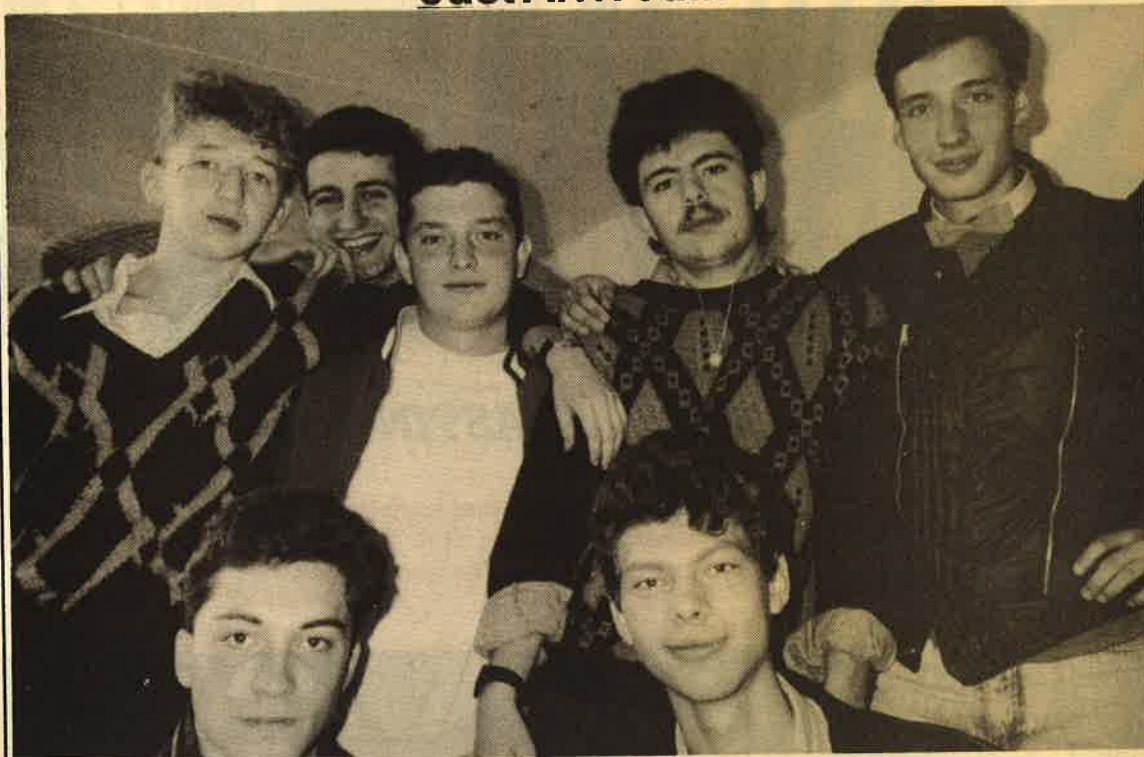
New Jewish youths from Russia now in Israel