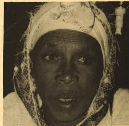
A new immigrant from Ethiopia