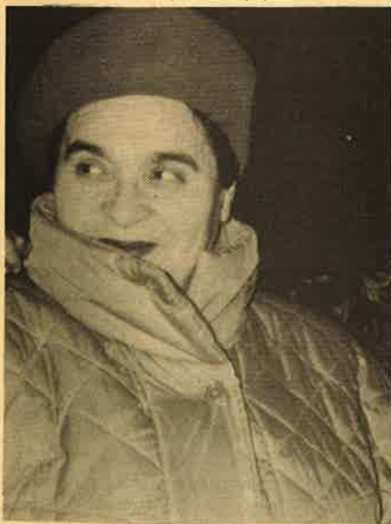
A new immigrant from Russia