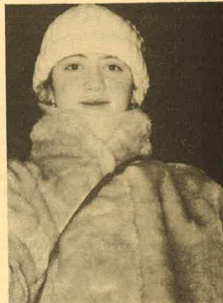
A new immigrant from Russia