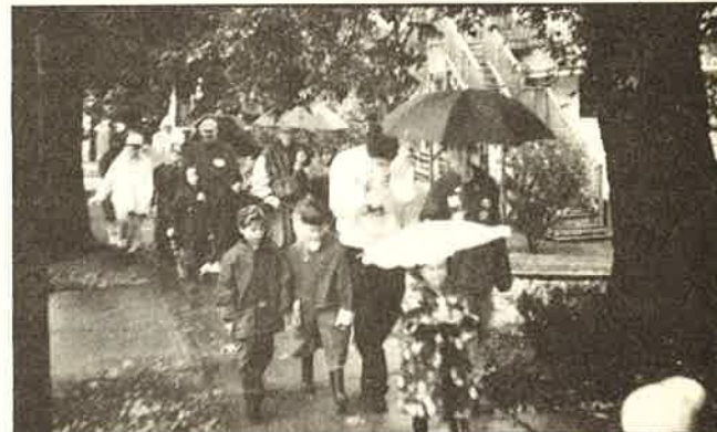
"Rained on our Parade..."