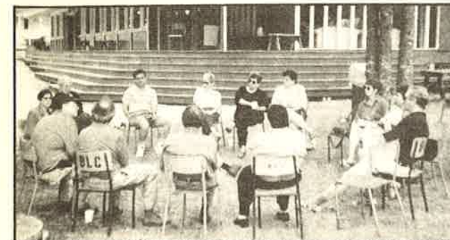
The CHEVRA meeting at the annual UIA Leadership retreat held at Camp Kadimah, August 1994