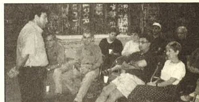
RAFFI ALLOUL, member of Israeli Knesset updates current situation to some of the attendees at the UIA Summer Retreat.