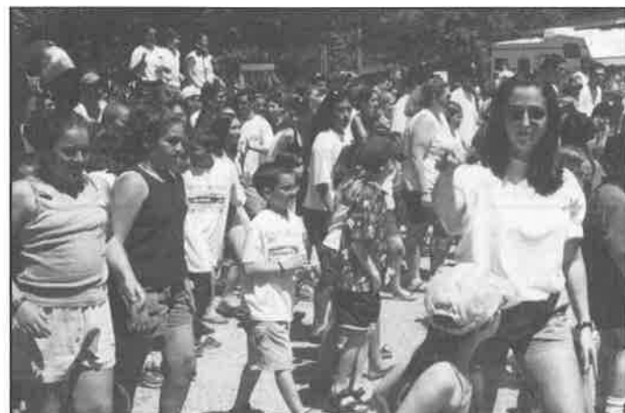
Campers performing on Visitors' Day, Camp Kadimah, 2001.