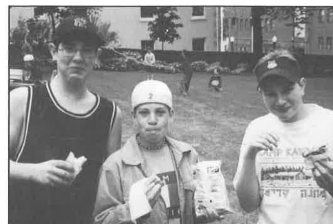
"Just Growing Boys"