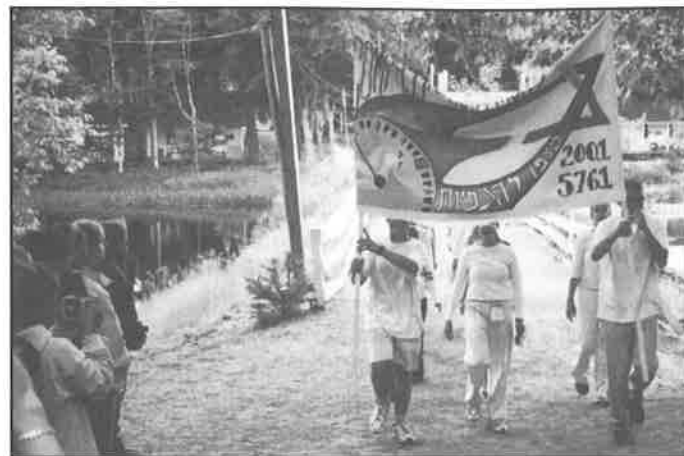
White Team March Past reviewed by visiting dignitaries, Camp Kadimah, 2001.