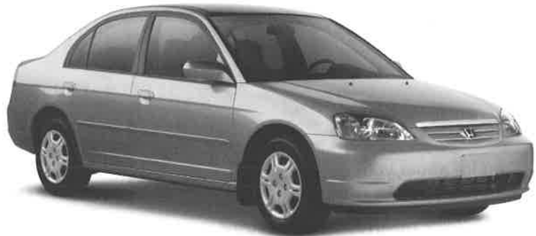
2001 Civic Sedan

With more interior room, more power, more safety features, more fuel efficiency... the all-new 2001 Honda Civic delivers more value for you. Test drive the all-new Civic at Atlantic Canada's largest Honda dealership—Colonial Honda. We've been delivering Honda quality and value since 1975.