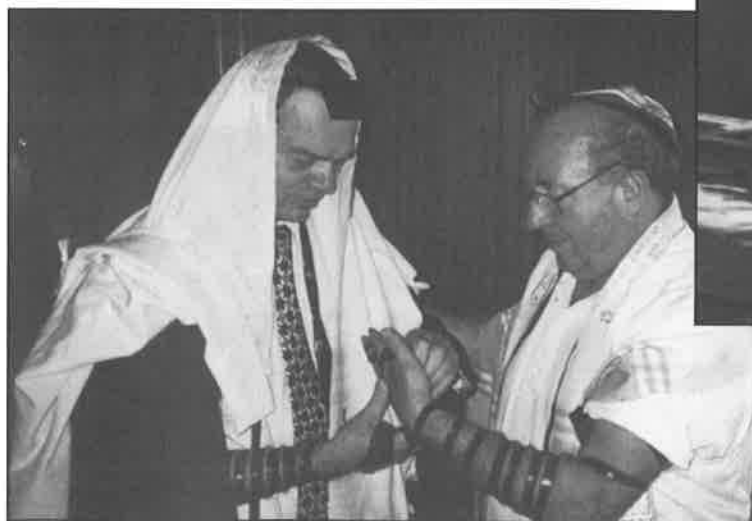
Putting on tefillin for Friday morning service.