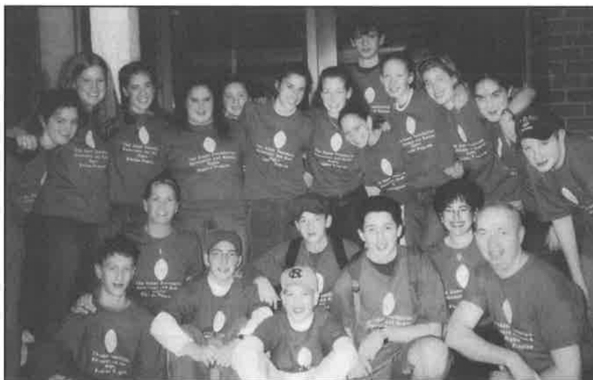
Trip to Washington, May 2001 – Atlantic Region Group

From May 20th until May 24th groups of Jewish youth from different cities across Canada, with generous funding from The Asper Foundation, gathered in Washington D.C. to learn more about the Holocaust.