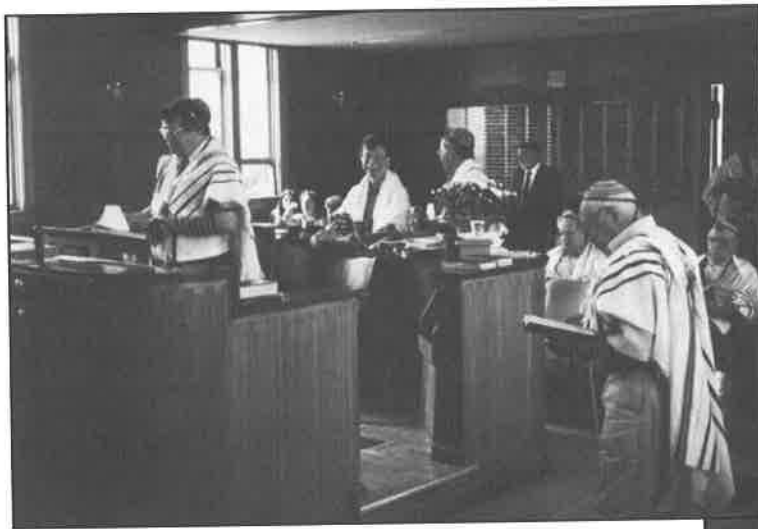
Special services at the Congregation Sons of Israel.