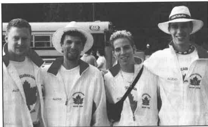
Maccabia Games – Israel