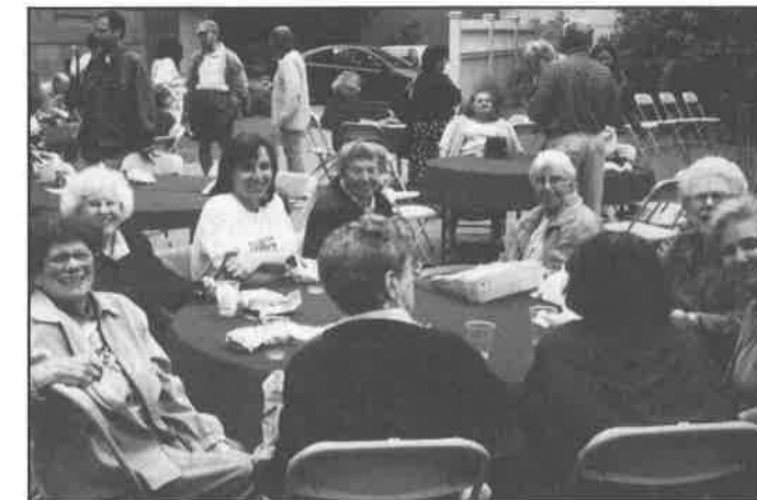
"The Girls" enjoying themselves at the community picnic.