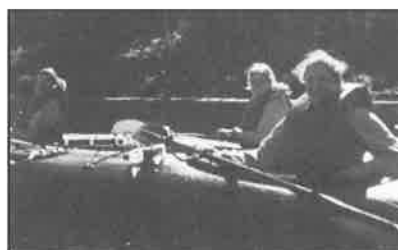
Grades 7 - 12 - deep sea kayaking!