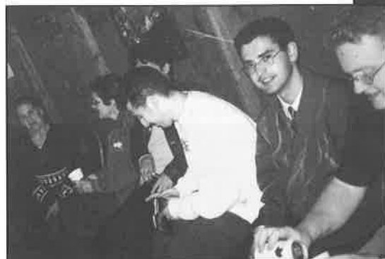
APJSF students enjoying the Sukkot Beer & Chicken Wing party at the Shaar Shalom, October, 2001.