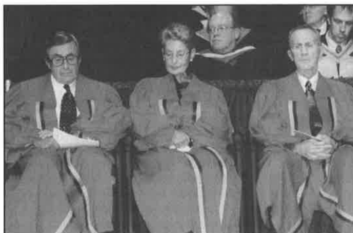
Fall Convocation – Université de Moncton.