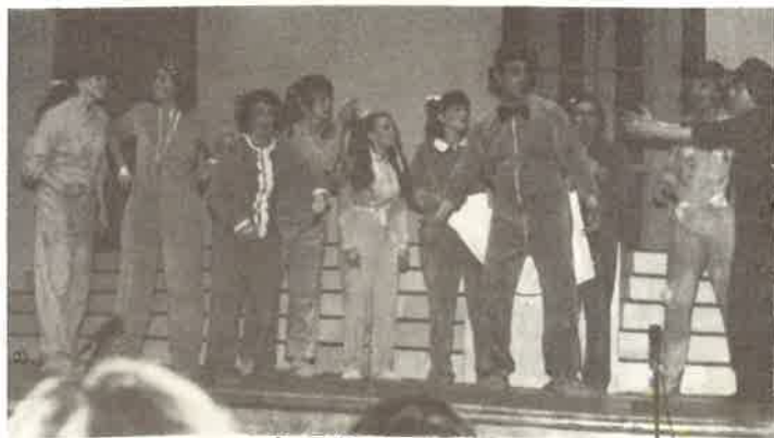
Scenes from "Stairway To The Stars".