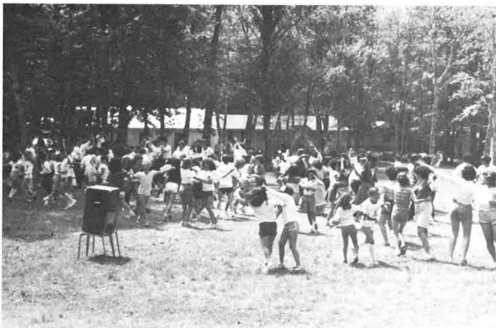
Our popular dance—wah, wah, wah, wah . . .

Camp is good, camp is fun I like to swim and to have lots of fun. The counsellors are nice, and my friends are good too, And I'm glad I have my sister and brother here too.