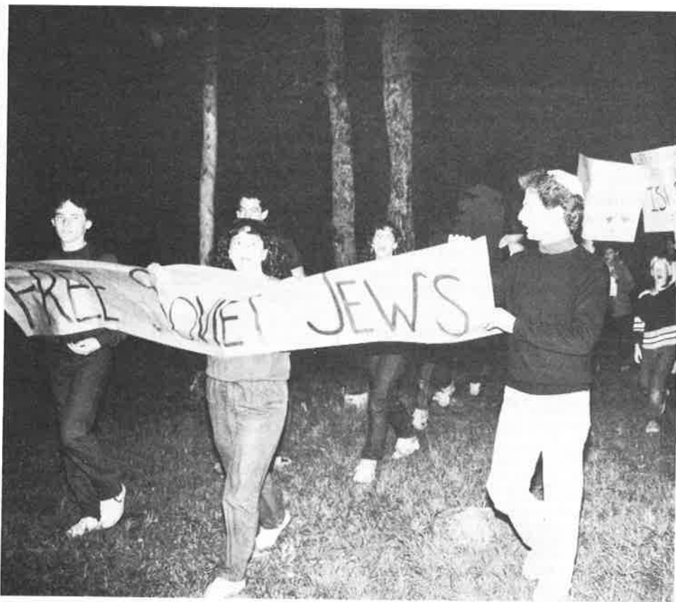
Protest March By Kadimah Campers

A petition signed by all the campers was sent to Soviet Ambassador to Canada, Alexander Yaacoulev . The petition demanded among other things that the Soviet Government respect various international covenants and declarations it has signed promising to honor basic human rights and freedoms.