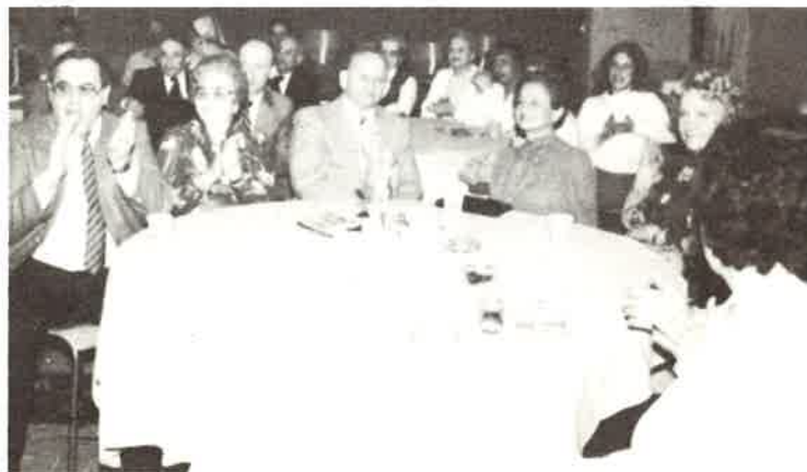
While the audience claps and enjoys the concert.