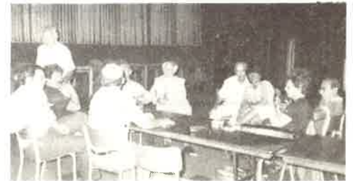
Visitors to Fredericton