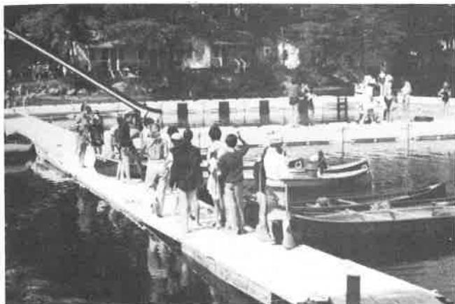
Waterfront Day at Camp.

The day of Waterfront day began when they woke us at 6:30. They divided us up in four groups. Their names were Army, Navy, Airforce, and Marines. The day was filled with events. Most of the events were swimming, relay races and running races. The day was very fun. I thank everyone who helped and planned it.