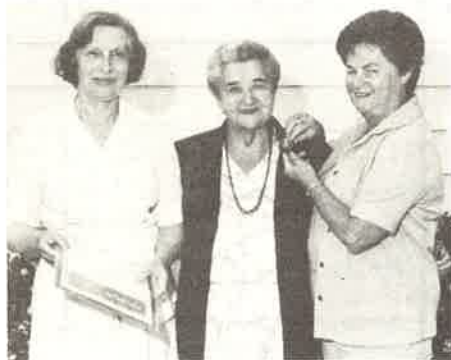
Hebrew Ladies Aid & Auxiliary Glace Bay