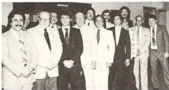
New Executive 1982-1983.

The Halifax Citadel Lodge thanks all those who contributed in any way to this effort. Thank you cast and crew, behind the scene workers, advertisers and above all—thank you to each and every one of our audiences.